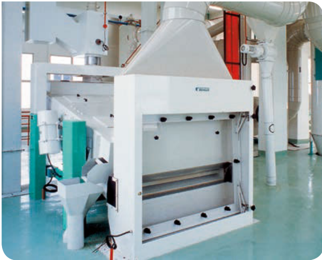
Separator MTRC – efficient sorting and classifying machine.